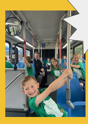
Grade Bus Wash