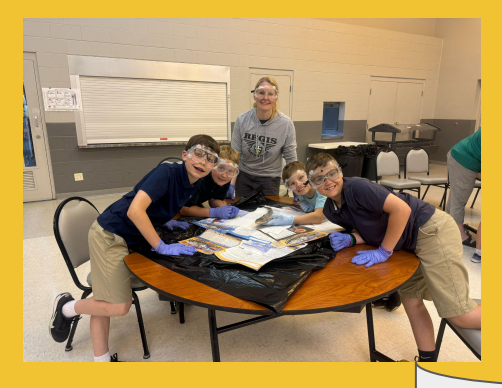
5th Grade Promotion