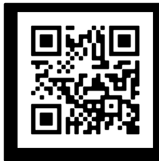
Book Fairy Campaign